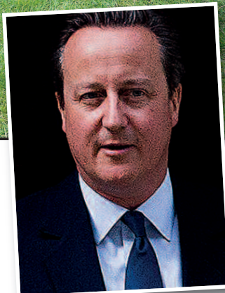
David Cameron is to play in a Downing Street showpiece football game to show the Government's support for west London's initiative to counter radicalisation and gang culture